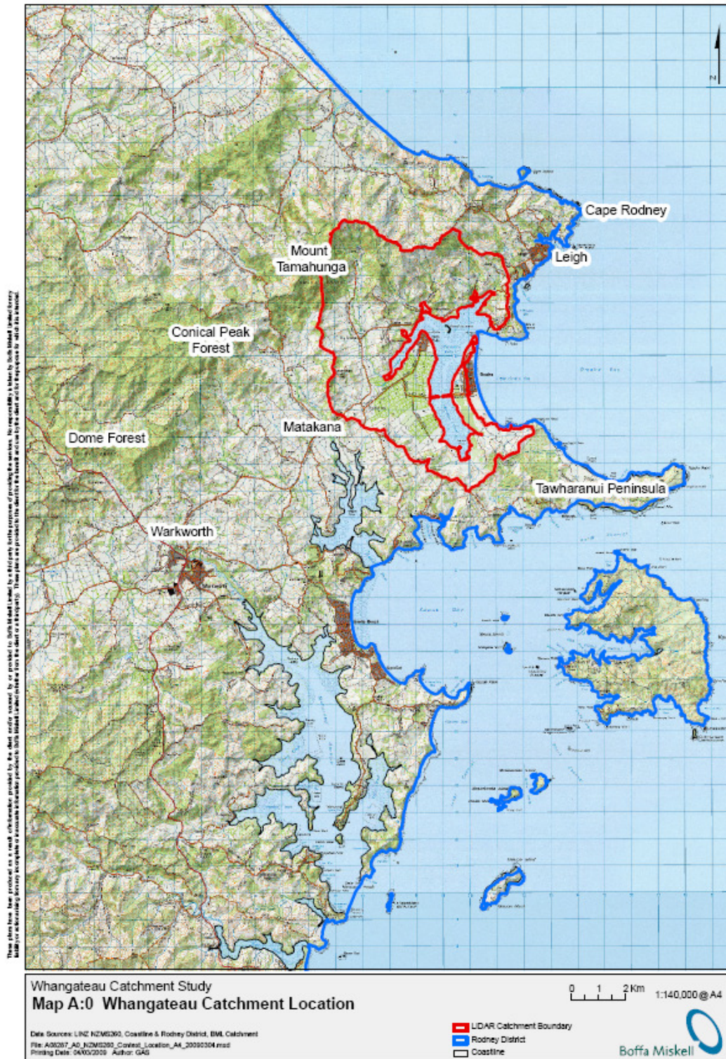
Figure 1 Whangateau Catchment