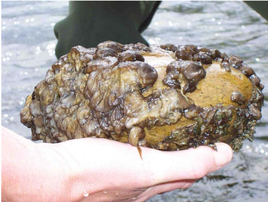
Figure 1 Didymosphenia geminata growth in the lower Waiiau River.